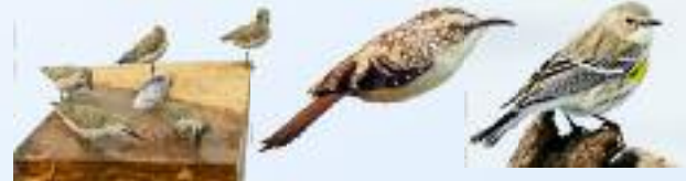
Bird Carving & Painting

At The Shekinah Retreat Centre On the North Saskatchewan River Near Waldheim, Saskatchewan